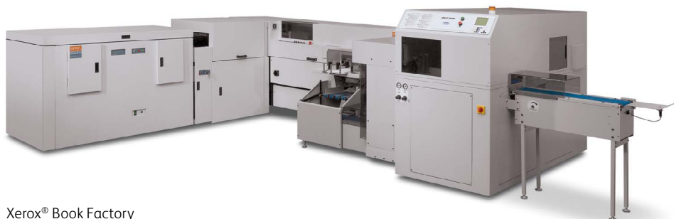
Xerox® Book Factory