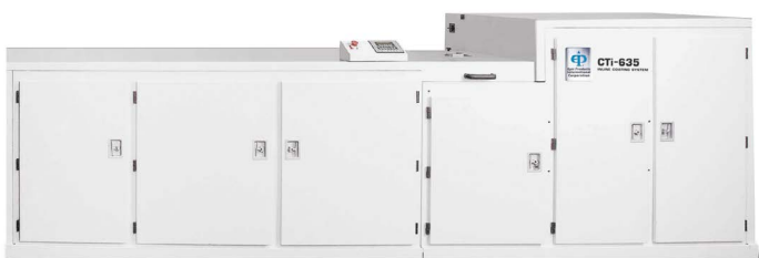
Epic CTi-635 Inline Coating System