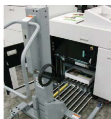
Xerox® Power Eject