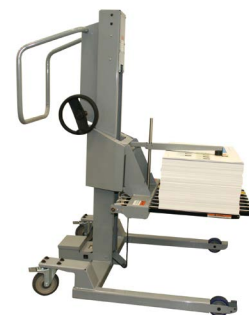
Production Media Cart