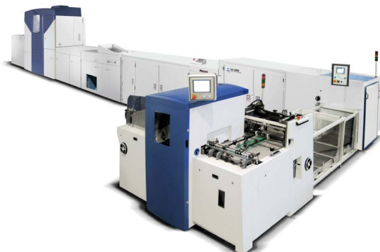
Xerox® Automated Packaging Solution for the iGen® Press

Adding a perfect finishing device to your Xerox® iGen4 or 8250 family of products has never been easier. You'll appreciate the variety of outstanding inline finishing solutions that are available from Xerox to help you quickly and efficiently produce high-quality bound documents. We offer you the widest range of finishing options you need to wrap up your jobs professionally.