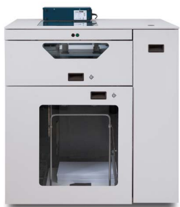
Xerox® Dual-Mode Sheet Feeder