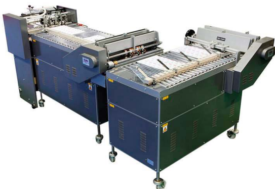
Rollem JetSlit System