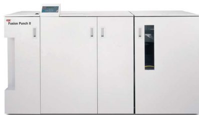
GBC® FusionPunch® II