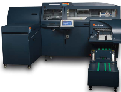
C.P. Bourg® 3202 Perfect Binder