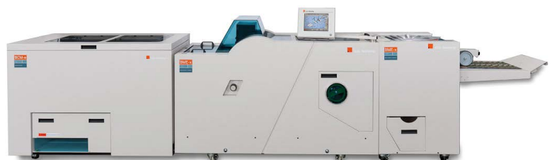
C.P. Bourg BMEx Booklet Maker