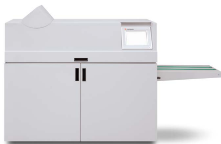
C.P. Bourg BDFEx