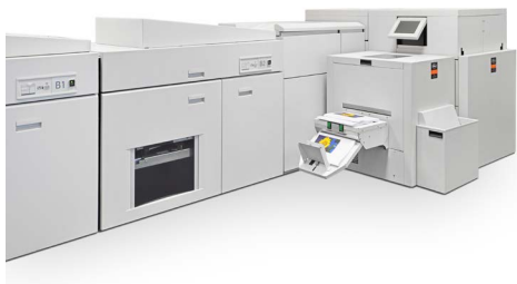
Watkiss PowerSquare™ 224