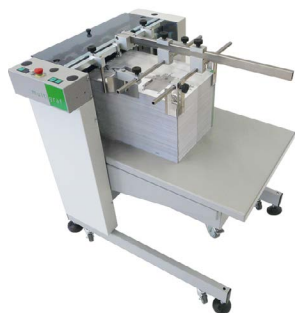
Multigraf PST-52 Stacker