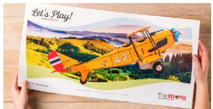
Extra-long sheet printing – maximum paper size 330 x 660 mm

It all adds up to better margins, higher profits and the ability to grow strategically with a single, future-proof investment.